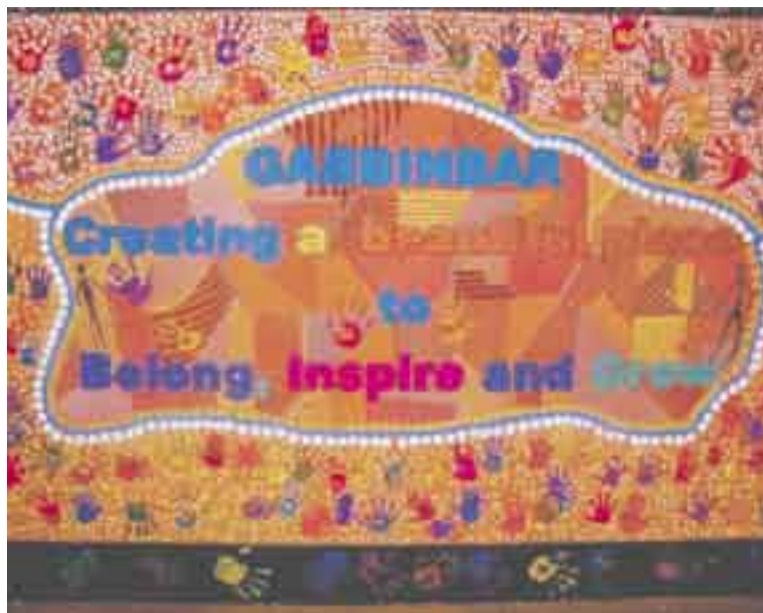
Gabbinbar State School's vision.

With this in mind the staff, students and parents were confronted with the question, "What does a beautiful place mean?" What does it look, sound and feel like? How do we create and articulate such a place?